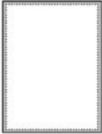
Full Page Bleed or Non-Bleed